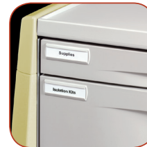
Drawer Label Holder